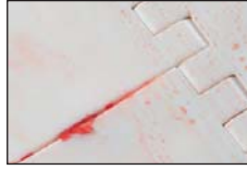
Traditional assembly pattern with numerous directional joints

Demands on conveyors and machinery in the food industry are constantly increasing. The focus is aimed more and more at clean design. In cooperation with several OEM's in the food industry uni-chains has developed the new uni S-MPB Single Link™. With a small 1 in. pitch it was designed with all the benefits of the 2 in. pitch uni MPB Single Link™. uni S-MPB Single Link™ is easy to disinfect. The directional joints, where bacteria can grow, are eliminated throughout the belt width. The surface is stiffer and the impact resistance is improved. A tighter transfer is possible due to the small pitch. The perfect solution for transporting food.