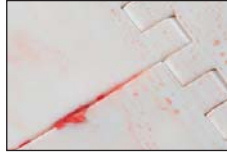
Traditional assembly pattern with numerous directional joints

Demands on conveyors and machinery in the food industry are constantly increasing. The focus is aimed more and more at clean design. In cooperation with several OEM's in the food industry uni-chains has developed the new uni S-MPB Single Link™. With a small 1 in. pitch it was designed with all the benefits of the 2 in. pitch uni MPB Single Link™. uni S-MPB Single Link™ is easy to disinfect. The directional joints, where bacteria can grow, are eliminated throughout the belt width. The surface is stiffer and the impact resistance is improved. A tighter transfer is possible due to the small pitch. The perfect solution for transporting food.