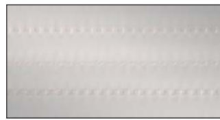
uni S-MPB Single Link™ with full-width links and no directional joints